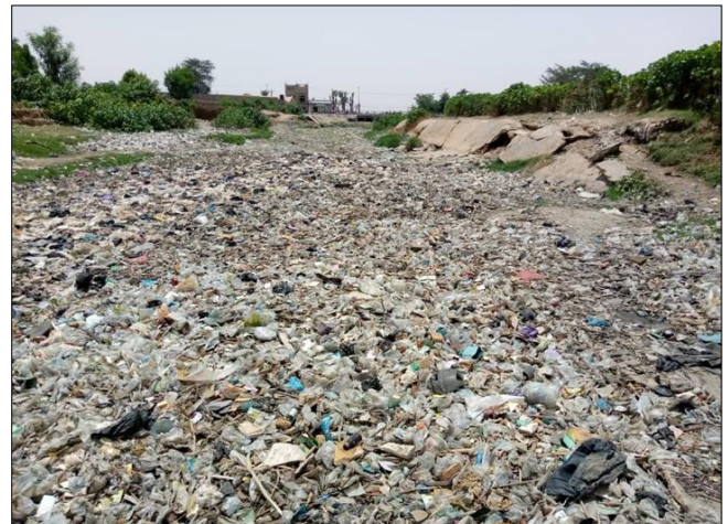
Fig 4: Improperly disposed plastic waste materials that have accumulated in the river Ginzo channel close to Kofar Durbi

water to cause flooding. Some of the materials dumped into the river channel include household wastes including old textile materials plastics, pit latrine excreta, dead animals that are concealed in sacks and pieces of plastic materials of different sizes. Improper waste disposal harbor flies, cockroaches and rodents that are vectors of diseases. Some of the waste materials such as plastics have accumulated in large quantities at a location close to Kofar Durbi can be seen on figure 5 below.