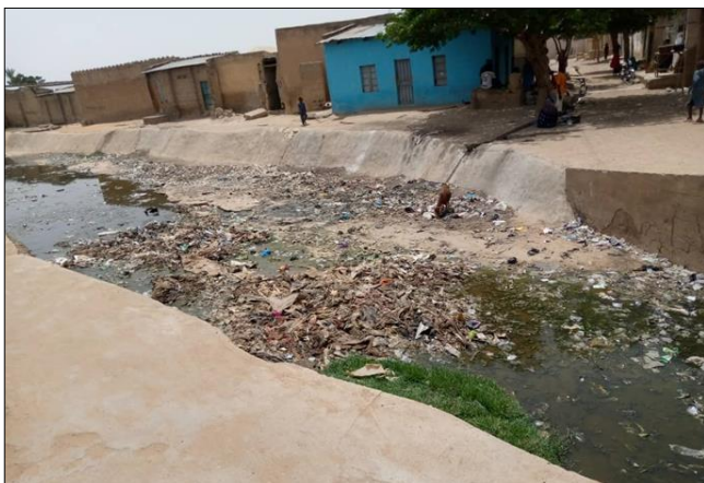
Fig 6: Stagnant sewage water at Layin Zana residential area

This is the fourth environmental health issue affecting residential areas along the river. There are several circumstances that could lead to the spread of disease to the people. First is the stagnant sewage water that is found on the river becomes breeding grounds of mosquitoes. Children also play in the river channel which contain sewage that can potentially lead to infections and diseases. At Kofar Durbi residential area, some children were seen swimming in a pond of sewage within the river channel during field work. The swimming in sewage water could potentially lead to skin infections and contacting diseases such as bilharzias or schistosomiasis . There is also the risk of falling into the river channel due to its closeness to houses and some bridges across the river have no hand rails to prevent people from falling into the river. Figure 6 below shows stagnant sewage water in the river channel close to houses.