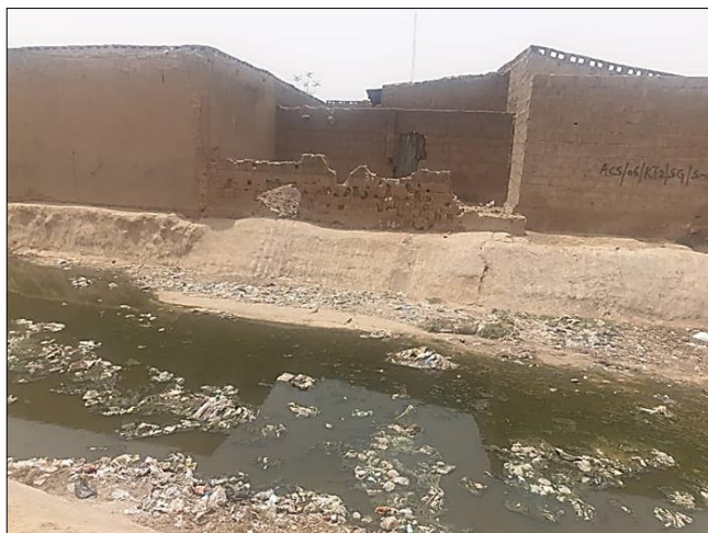
Fig 3: One of the outer walls of a house that collapse close to the river ginzo channel.

This environmental health issue has become a perennial challenge that occur every rainy season. The river channel has been constructed into a storm water drainage and in that process the width and depth of the channel has been reduced. This reduction means that during heavy rain that last for an hour, the rain water overflows out into its flood plains that has been built up with houses. This overflow brings damage to properties and the residents have to spend time and energy scooping water at most of the houses that are located few meters close to the storm water drainage. Also, the flood waters flow into open wells thereby contaminating the water especially in residential areas such as Katsira and Layin Zana. In certain instances, the flood leads to the collapse of outer wall of the houses. This collapse of one of the out walls can be seen on figure 4 below