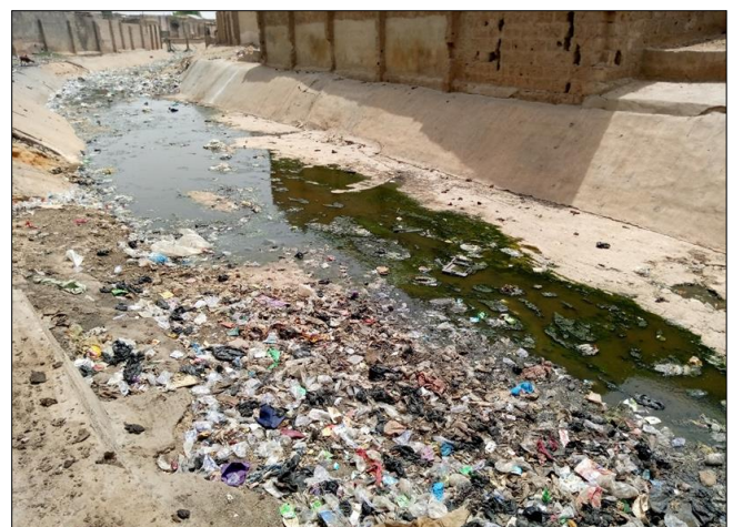
Fig 5: Waste materials and sewage on the river bed as sources of air pollution at Kwalan Kwalan residential area.

This is the third environmental health issue affecting residential areas along the river. One of the major cause of air pollution is the decomposition of waste materials due to improper waste disposal. The decomposition of materials in waste water or sewage also cause air pollution. The sewage is found on the river channel for most of the year during the dry season. The dropping of dead animals and pit latrine excreta further compound the level of air pollution. There is also the smell from human excreta that spread into the air due to the practice of open defecation prevalent in some of the residential areas. According to the World Health Organization (WHO) (2023) [29, 30], air pollution causes respiratory and other diseases which are important sources of morbidity and mortality. Figure 5 below shows some of the sources of air pollution in the residential areas which are sewage and waste materials decomposing to cause air pollution.