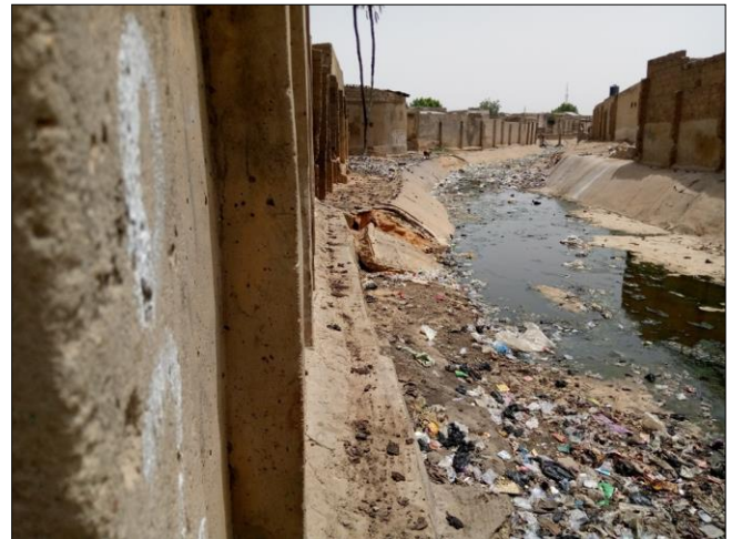
Fig 7: Open defecation behind houses along the river at Kofar Kaura residential area

This research will also recognize some of the challenges facing the people in the residential areas which affect their environmental health conditions which were observed during the field visit.